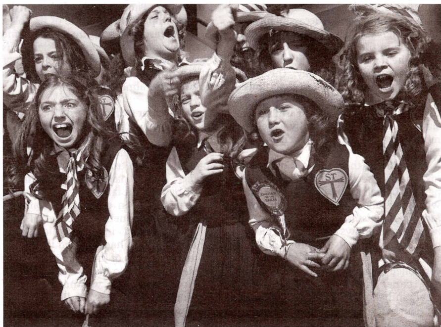
Boys beware. We're on the march

The one mathematical gap that did not disappear was the differences between